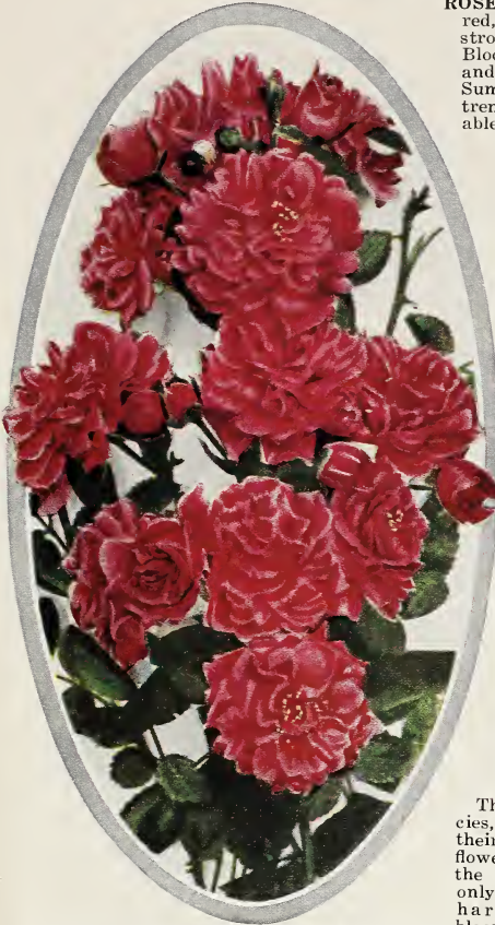
Crimson Baby Rambler Blossoms. A Popular Favorite. Too Well Known to Need Description. Strong Plants. Price, $1.50 each, $14.00 per 10.

growing from 5 to 15 feet, and by their tough, curiously wrinkled or rugose foliage. Particularly valuable for hedges or shrubberies in seashore gardens or regions where the winters are very severe.